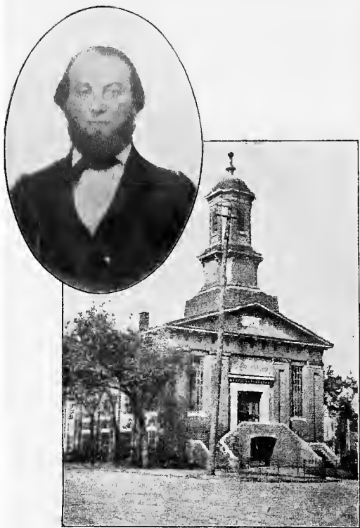
THE PASTOR AND HIS CHURCH, MONTGOMERY, ALA. 1852-1868.